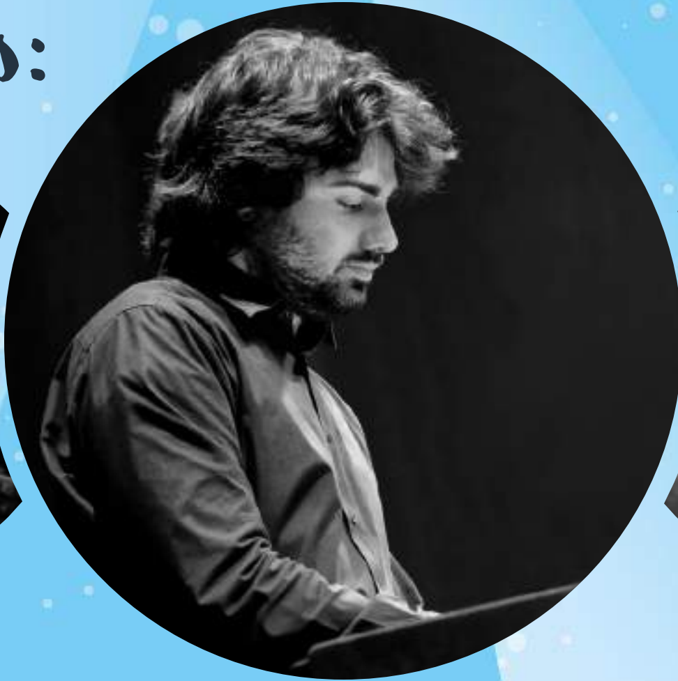
PIF CEREGIOLI Piano